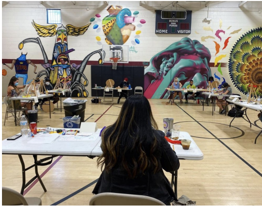
BIPOC individuals and facilitators (above) create art together during workshop.